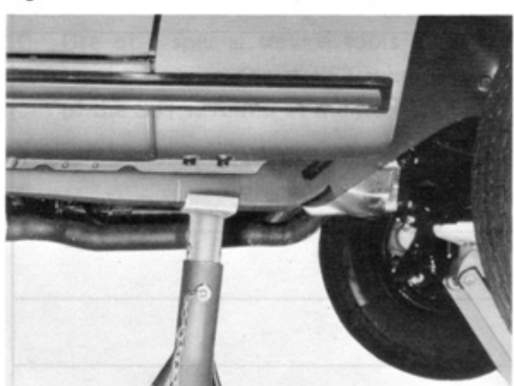
Fig. 1-4 Rear